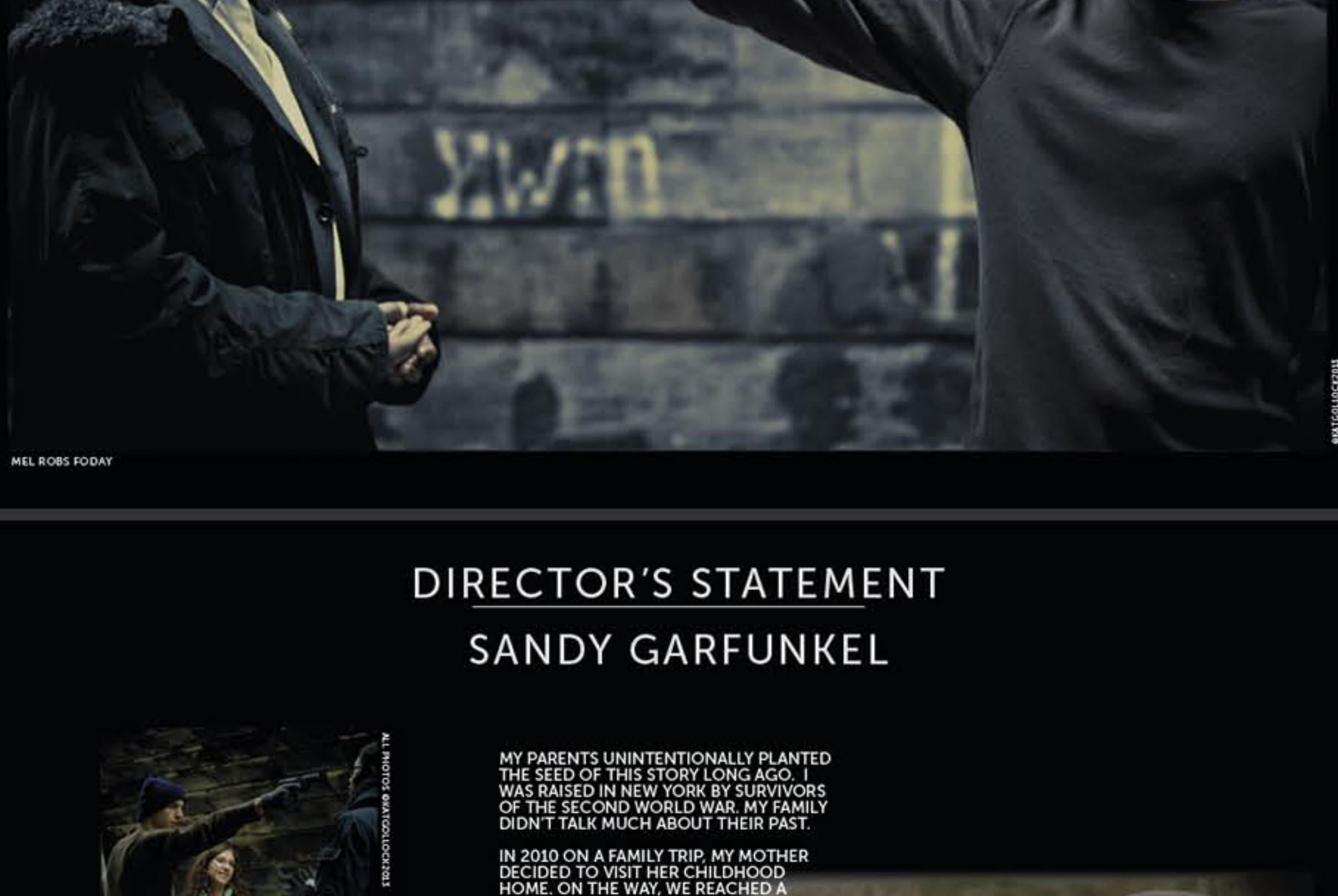
MEL ROBS FODAY

AFTER BEING ROBBED AT GUNPOINT A MAN TURNS THE TABLES ON HIS MUGGER BUT, IN TRYING TO TEACH THE ATTACKER A LESSON, ENDS UP CONFRONTING HIS OWN DEVASTATING MEMORIES OF A CHILDHOOD LOST